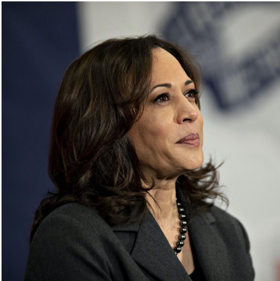
The first Black woman to be nominated for vice president by a major party, Kamala Harris owns properties in Los Angeles, San Francisco, Calif. and Washington, D.C.

Thanks in large part to its location in major cities, Sen. Harris’s real-estate portfolio exceeds Mr. Biden’s in terms of value. Mr. Biden owns roughly $5 million worth of real estate, according to a recent Wall Street Journal analysis: an estate in Wilmington, Delaware’s “château country” next to a man-made lake built by the du Pont family and a beach house in Rehoboth Beach. Last year, the Bidens rented a large Georgian-style home in the D.C. area that once belonged to former Secretary of State Alexander Haig.