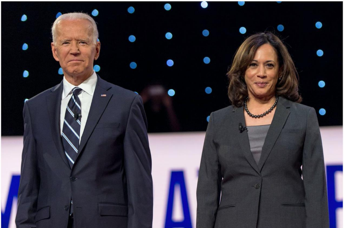
Thanks in large part to its location in major cities, Sen. Harris’s real-estate portfolio exceeds Joe Biden’s in terms of value.

In San Francisco, Sen. Harris bought her apartment in the SOMA neighborhood for $489,000 in 2004, records show. That same year, she began serving as California’s first Black district attorney. The property is about a mile’s walk from the San Francisco Superior Court House.