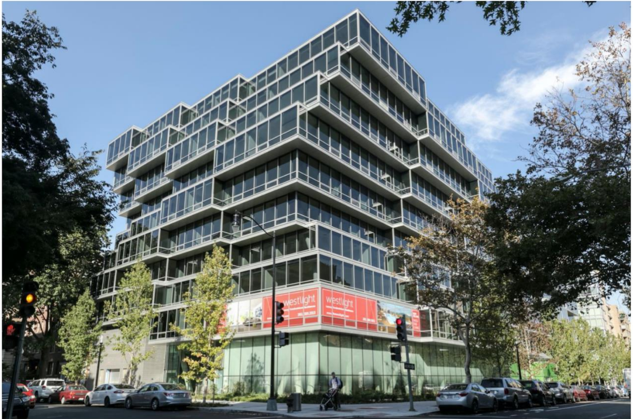
In Washington, D.C., Sen. Harris owns a condo at the Westlight condo complex in the district's West End.

The California senator and VP nominee owns property in L.A.'s Brentwood neighborhood, as well as San Francisco and Washington, D.C.